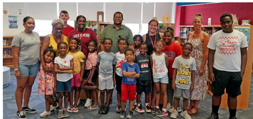
ABOVE Girard College teachers and students ran a six-week summer enrichment program for 1st and 2nd grade students to keep them on track with their learning.