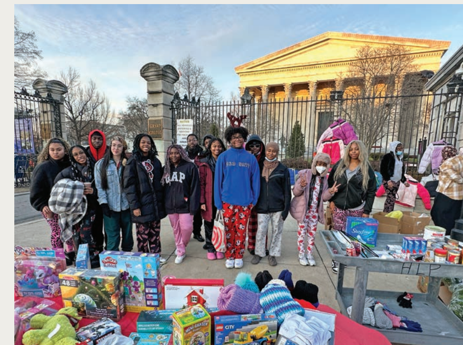
ABOVE Members of the high school Student Council organized the second annual Toys and Good Drive and hosted a distribution event for neighbors in need.

COMMUNITY SERVICE is a core component of a Girard College education, and the high school Student Council consistently leads the way. After a successful food drive prior to Thanksgiving, students organized the second annual Toys and Goods drive in December.